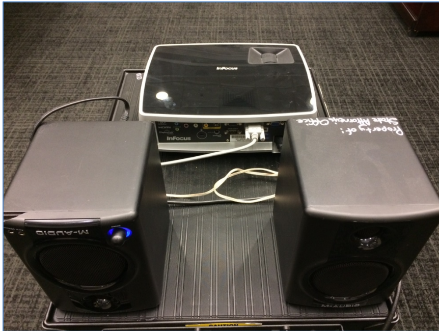
Figure 6 - Projector and Speakers