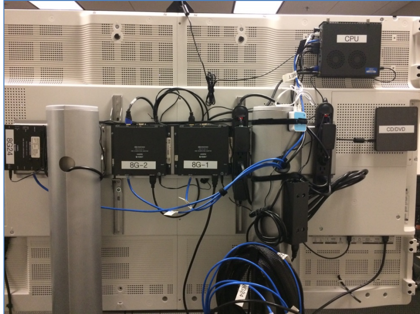
Figure 3 - Smart Board Back