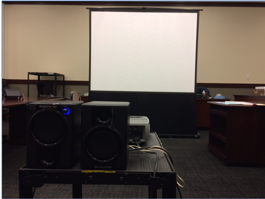
Figure 5 - Projector and Screen