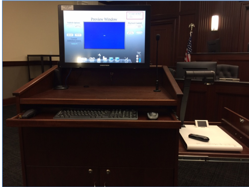
Figure 1 - Evidence Cart Front & On-Board Document Projector